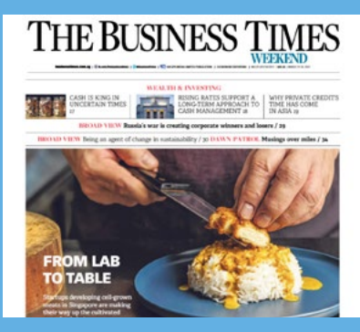
Singapore's top financial newspaper features GFI

Throughout 2022, GFI's insights and resources were sought and featured in leading global and national media outlets, helping us grow public support and political will for alternative proteins (see page 25 for highlights).