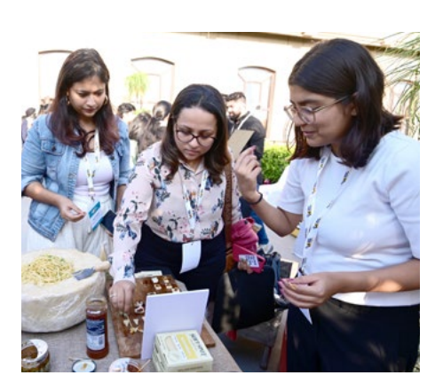
Attendees of the India Smart Protein Summit dig into the "tasting tour" where 15 startups showcased their plant-based meat, egg, and dairy products.

GFI India welcomed 580+ participants over two days for panel discussions and roundtables across industry, policy, and science, as well as an expo hall and tasting tour.