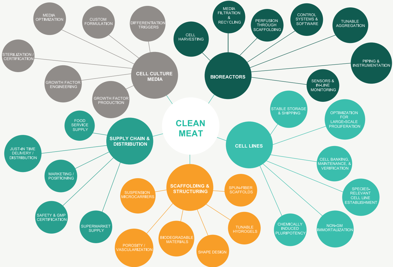
Figure 1. This conceptual mind map illustrates the primary elements for development and production of clean meat at large scale. Illustration courtesy of The Good Food Institute

quantities of cells multiply. Initially, donor cells are harvested from an animal either through live biopsy, immediately after slaughter, or from an embryo. After the initial harvest, there are a number of methods for sustaining the cells' capacity to proliferate continuously, thereby reducing and ultimately eliminating the need to isolate new cells. Companies are exploring several types of cells in various stages of differentiation to determine which cells exhibit optimal performance for both proliferation and maturation into the desired final cell types.