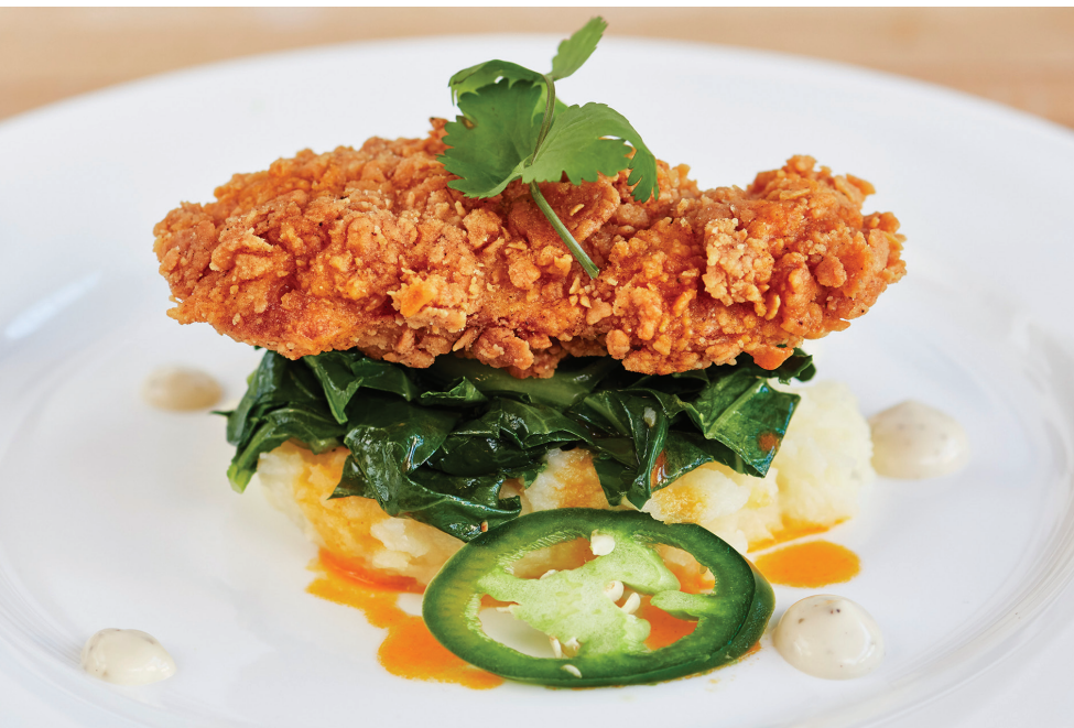
Memphis Meats last year unveiled chicken made by growing animal cells, which the company says is the first time that poultry has ever been produced with this method.

production method does not rely on shuttling calories through the metabolizing, moving, breathing, heat-generating body of an animal in order to obtain a small fraction of those inputs as meat. At scale, production of clean meat is predicted to be inherently more sustainable than current industrial animal agriculture.